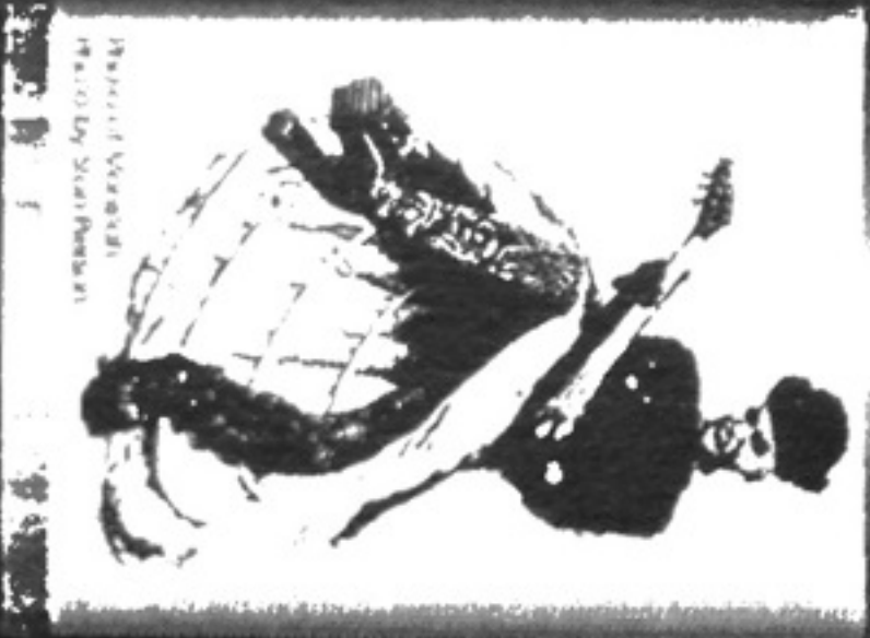
Harold Vorholt

"EXPECT THE UNEXPECTED" GW'S MARVIN BETTS THEATRE 800 21st Street NW Washington, DC